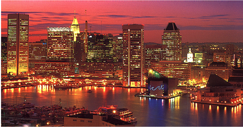
Baltimore, Maryland - Charm City, USA